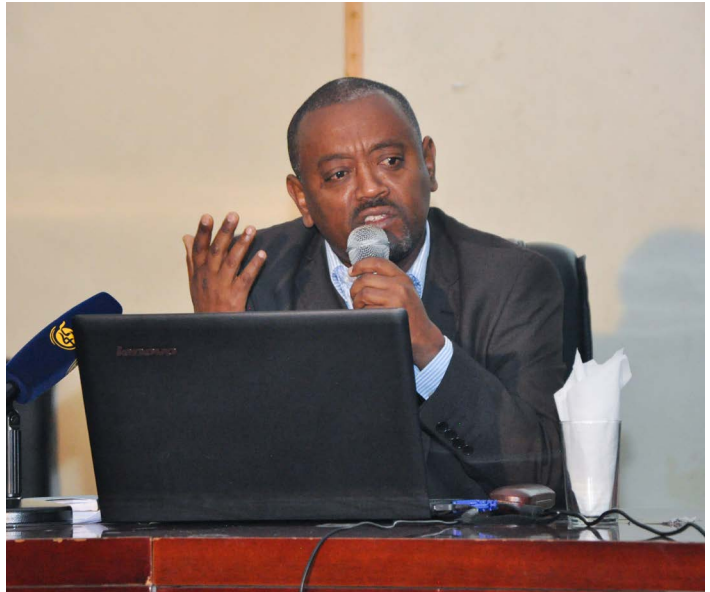
Ato Bezabih Gebreyes Civil Service Commission Commissioner